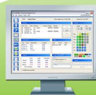
View and edit the clocking data on screen