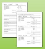
Print reports or export the data to Excel